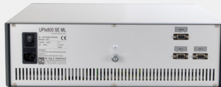
19" rack with MicroLabBox®